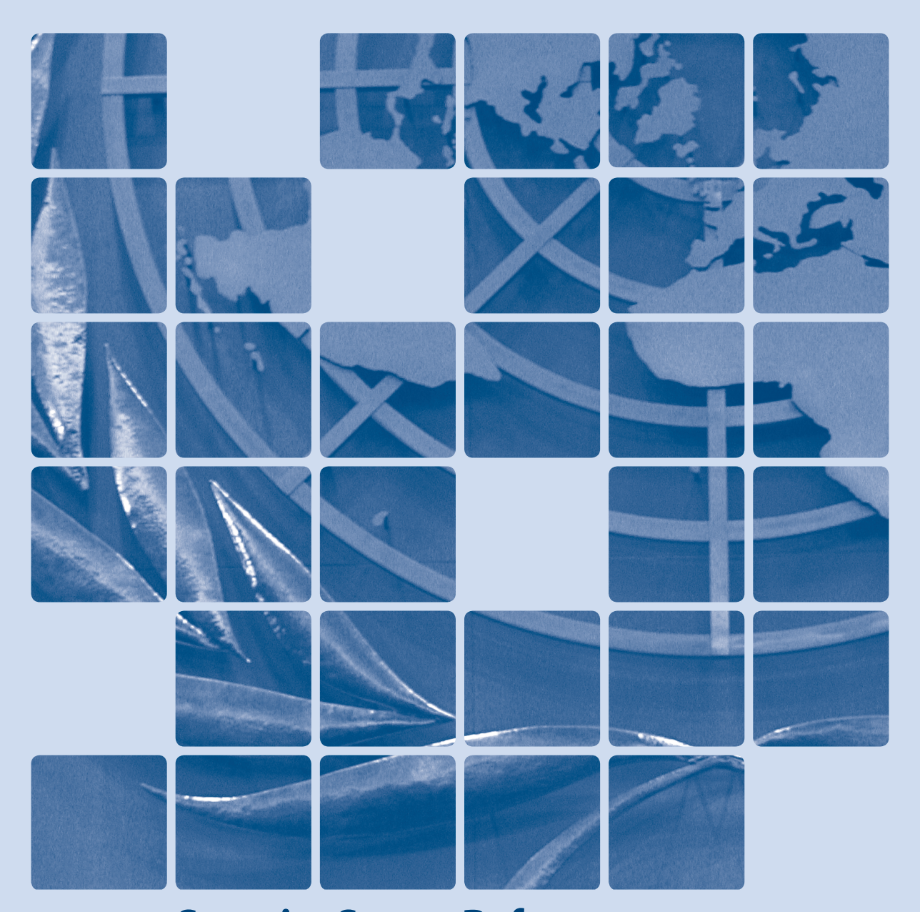
Security Sector Reform Integrated Technical Guidance Notes