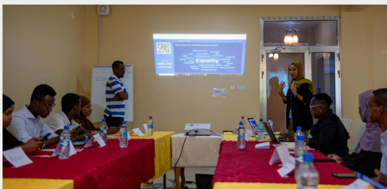
Mogadishu: Students from Mogadishu State University discuss progress in the justice sector and stress the importance of youth participation in shaping the country's judicial institutions with JCSC Judicial Affairs Officer (standing on the right).