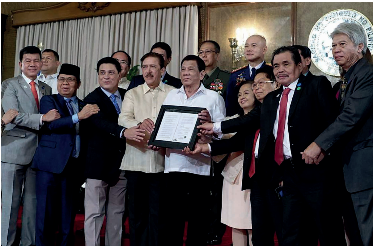
President Rodrigo R. Duterte, state officials and MILF negotiators approve the Bangsamoro Organic Law (BOL) at Malacañan Palace on August 6, 2018.

In a democratic system, the implementation of peace accords is likely to take place across several electoral terms, with new incoming governments being mandated to sustain the commitments made by their predecessors. Peace accord signatories are hence required to take a leap of faith in future governments, betting on their continued support for the peace process, when undergoing DDR and preparing for unarmed politics. In several countries discussed in this report, peace implementation was severely affected by the course of elections. In Colombia, the 2018 elections greatly hampered the implementation of the Havana Peace Agreement with the FARC-EP, while in the Philippines, the presidential election in