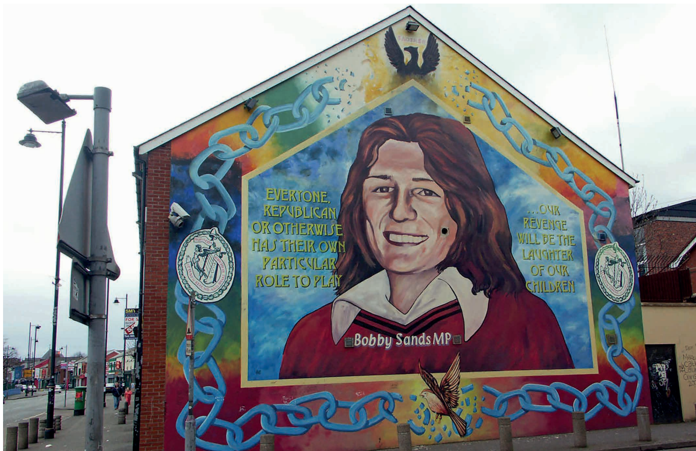
A mural showing the face of Bobby Sands, leader of the 1981 hunger strike in Maze Prison in Northern Ireland. He died after 66 days on hunger strike, one month after his election into the British House of Commons

These are relevant dimensions that influence both the perception of such appointments as legitimate and the emergence of a coherent new party from the NSAG's collective transition process.