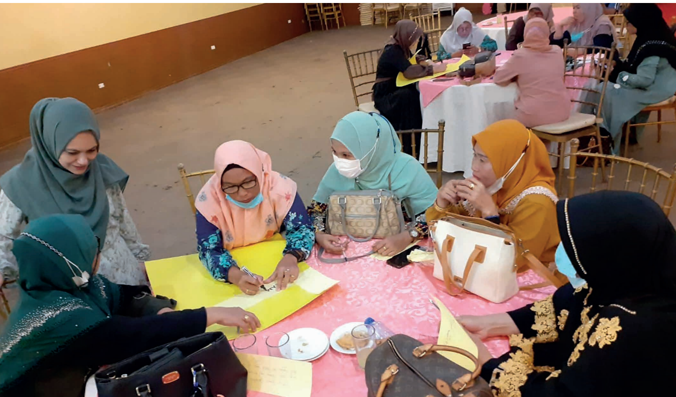
MILF women participate in a workshop on self-led post-war organising in Mindanao, July 2022

As a result of restrictive selection criteria for DDR support schemes which exclude non-combatant members, or gender-blind approaches which neglect the specific needs and interests of women combatants, the design and implementation of many DDR programmes exacerbate the precarious situations of demobilised women in post-conflict settings. In these cases, women who have been marginalised by and in relation to their male counterparts during the conflict are denied access to educational and economic reintegration packages. At the same time, female members of armed groups are exposed to severe stigmatisation and exclusion by receiving communities, while male ex-combatants often face fewer obstacles to reintegration into civilian life, taking up political positions and even creating a personal nimbus of war heroism supported by patriarchal ideals. 23 This inaccessibility of DDR benefits, social exclusion and denial of political agency create a threefold burden of post-conflict marginalisation.