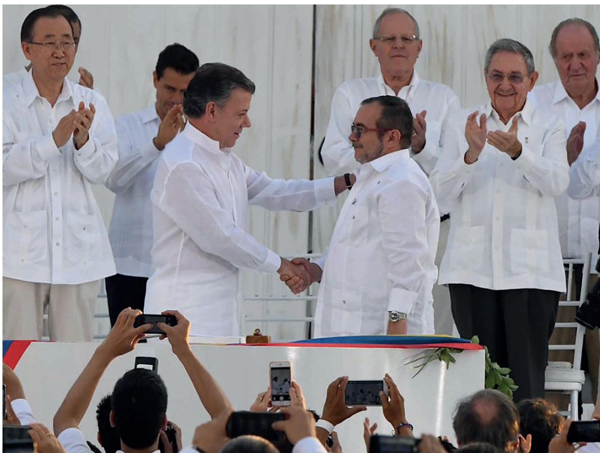
Colombian President Juan Manuel Santos and FARC leader Rodrigo Londoño Echeverri shake hands at the signing ceremony of the Havana Peace Agreement in Cartagena, Colombia.

By contrast, the collective transformation of the FARC-EP into a political party was a central element of the 2016 Havana Peace Agreement. It comprised elements of political participation, political opposition rights and electoral reform. However, the agreement lacked clarity and depth with regard to the political, economic and social reintegration of ex-combatants.