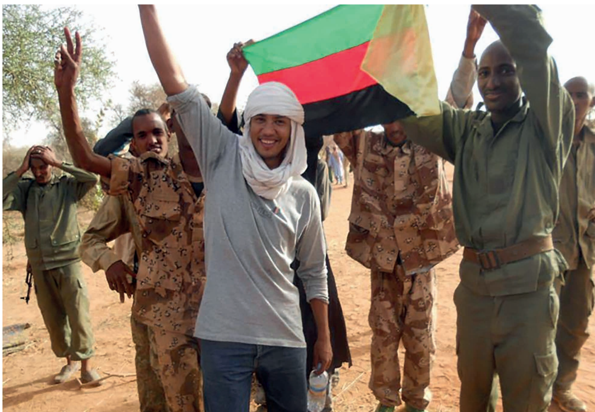
Men hold the flag of the National Movement for the Liberation of Azawad (MNLA), Mali.

As a counterweight to DDR, state actors must be ready to implement their own commitment to institutional reforms. According to the terms of the peace agreement, this may entail both political and security sector reforms, in order to open the political space to new contenders, while ensuring that the state's restored monopoly over the use of force is exercised in an accountable and