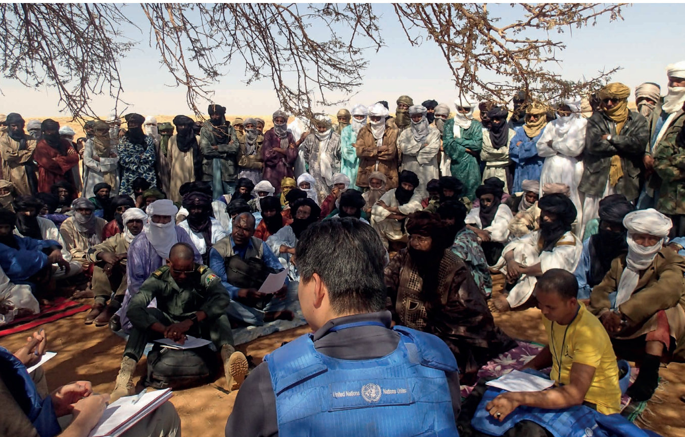
MINUSMA reconnaissance visit of cantonment site in Ilouk, Mali 2015

dimension of empowerment. The inclusion of civic education in DDR is critically important, especially in contexts where former NSAGs are clearly disenchanted with politics, as is the case in Libya, for example. Even engagement by former members of armed groups without a clear political agenda can pave the way for peace processes by channelling grievances into a new socio-political programme.