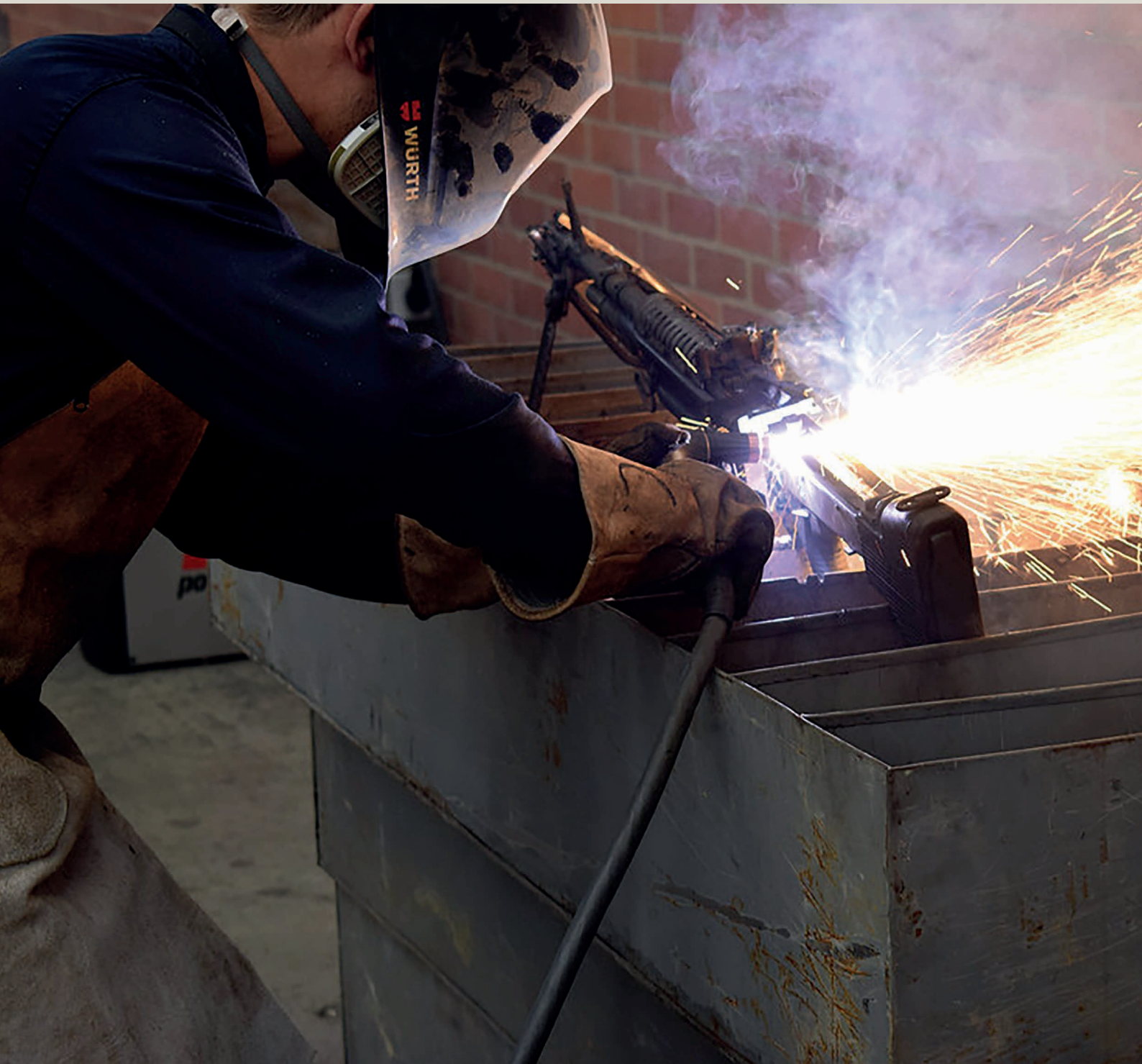
A gun is deactivated as part of the FARC-EP disarmament process in Colombia.