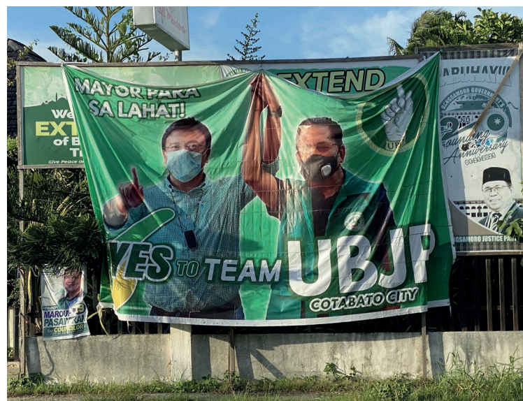
Electoral campaign by the UBJP party, May 2022

The ongoing process of political transformation by the MILF in the Philippines is rife with internal discontent since consultation with rank-and-file